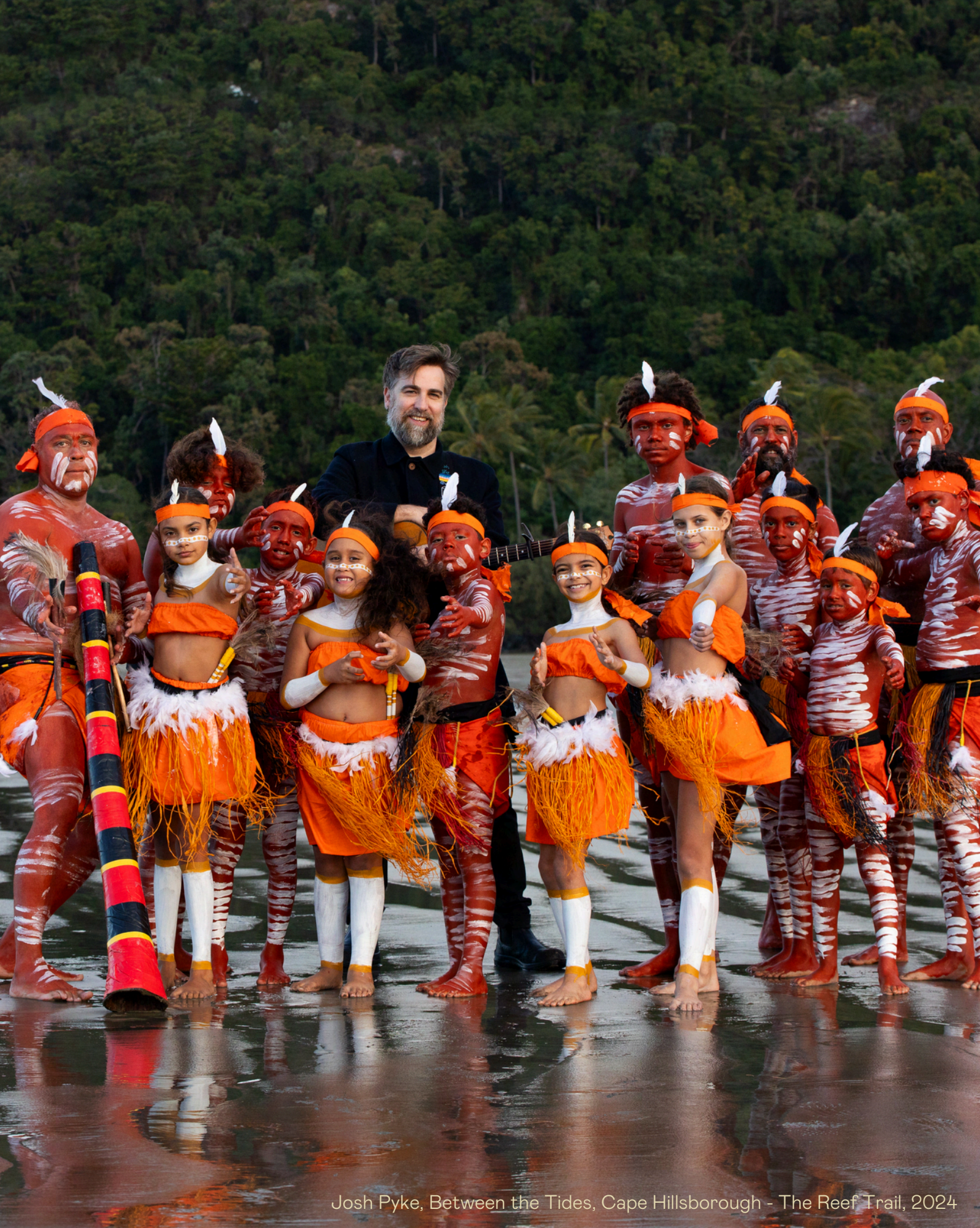
Josh Pyke, Between the Tides , Cape Hillsborough - The Reef Trail, 2024